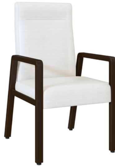
Model: CTEP12 23W 26D 40H 19.5SW 18SD 18.5SH 25AH

The Caterina Patient Chairs are designed to offer superior comfort and support in healthcare settings. Innovative features, such as the flex tall back and the optional short flex back, provide flexibility and adaptability to the user's needs. The chair's design includes a visible and open cleanout, facilitating easy maintenance, and back legs that protect walls from damage. Moreover, the field-replaceable seat and back cushions ensure longevity and sustained comfort, making it an ideal choice for patient rooms.